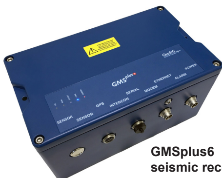
GMSplus6 seismic recorders