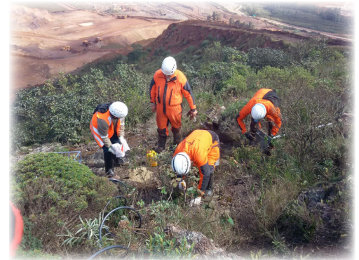
The mining site was located near some protected natural caverns in Brazil.