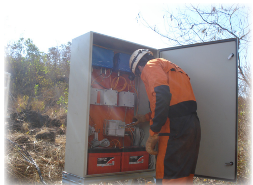
The instruments are accessible in the control cabinet.