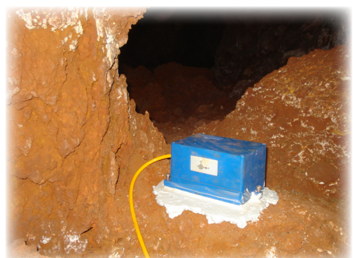
The GMSplus6 in situ.